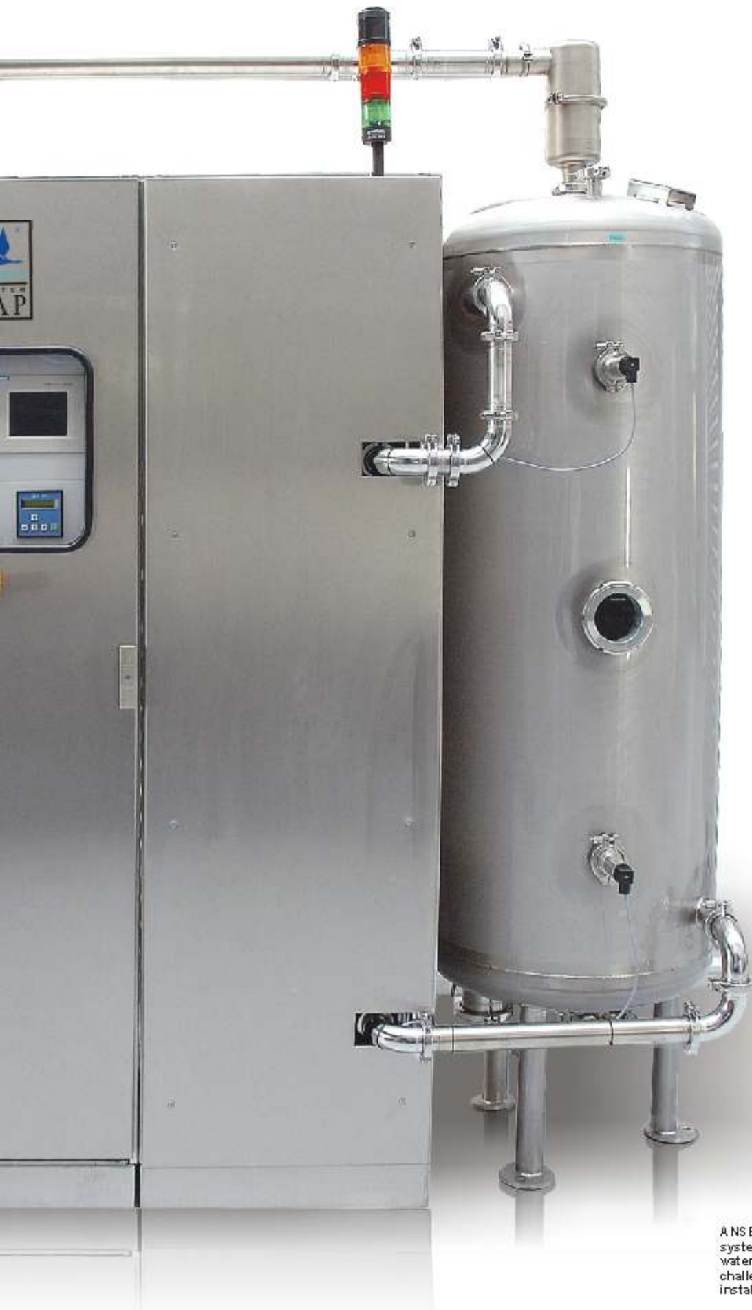
ANSEROS PAP 5000 WATER SYSTEM , a robust system, free of chemicals, for drinking & bottling water treatment. Outstanding performance in any challenging requirement. Integrated plug & play installation and zero maintenance.