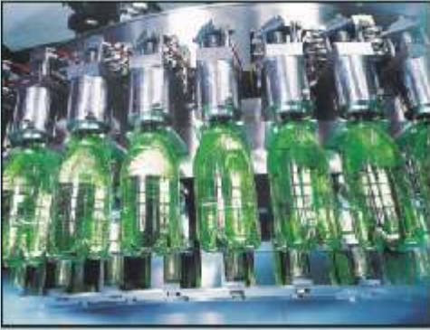
RINSING & BOTTLING